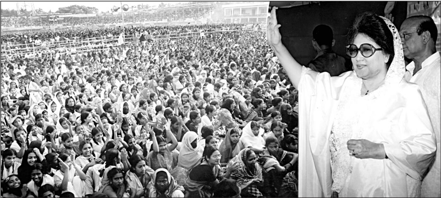
Prime Minister Khaleda Zia waves at the supporters at a public meeting at Chandpur Stadium yesterday. Chnadpur district BNP organised the meeting.