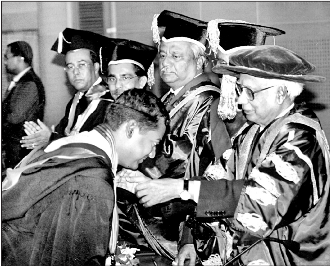
President Iajuddin Ahmed gives away medals and certificates among the graduating students of the University of Asia Pacific at its first convocation ceremony at the Bangladesh-China Friendship Conference Centre in the city yesterday.