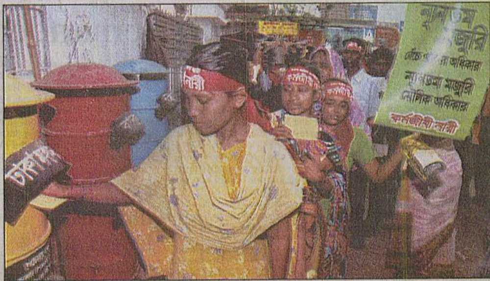
Working women post letters addressed to the prime minister, demanding fixation of minimum wages in consistency with inflation and price hike of essentials, after a rally near GPO in the capital yesterday.