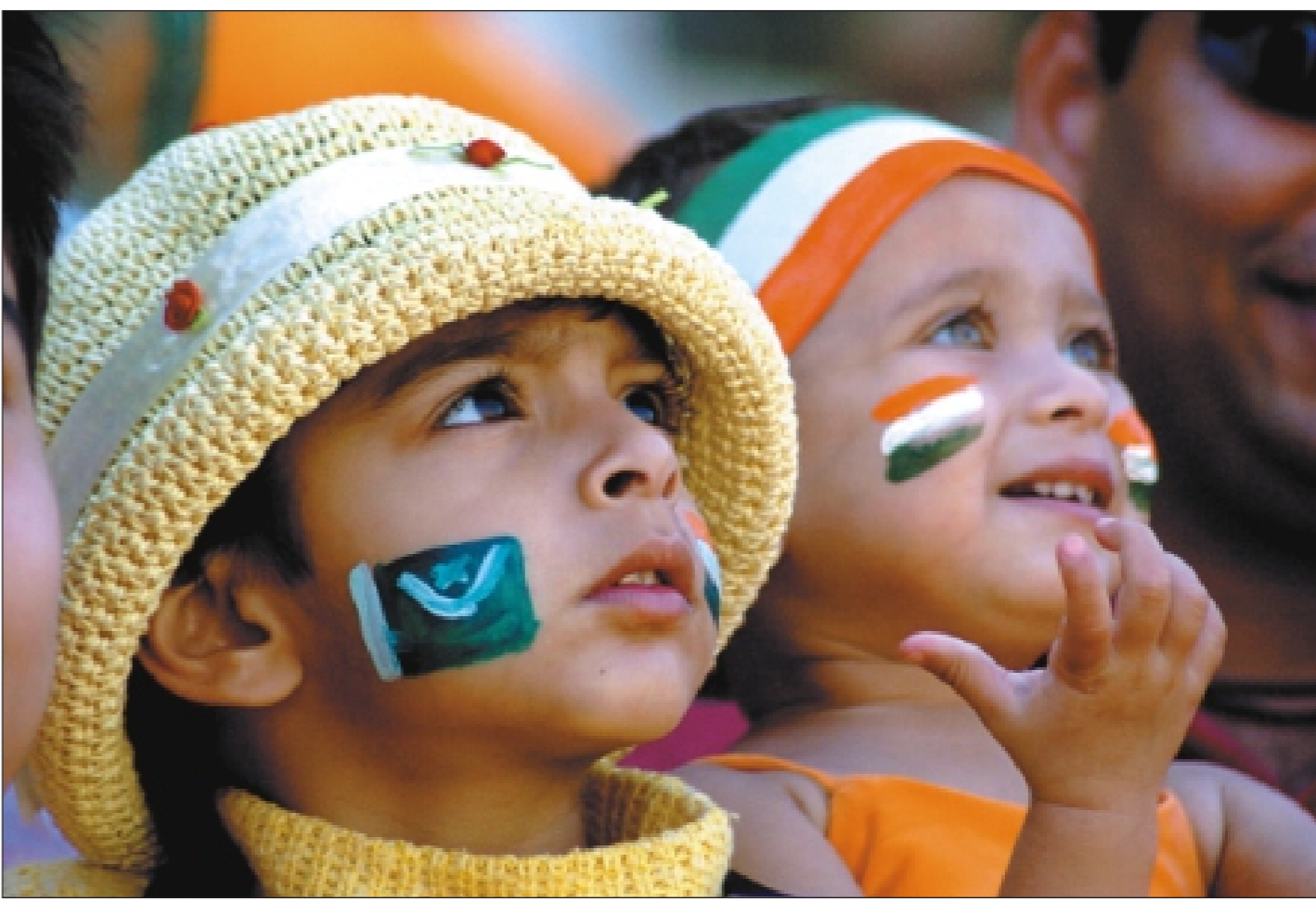
RIVALRY MEANS NOTHING TO THEM: Two tiny tots, presumably an Indian and a Pakistani, enjoying themselves on Day Four of the first Test between India and Pakistan at Mohali yesterday.