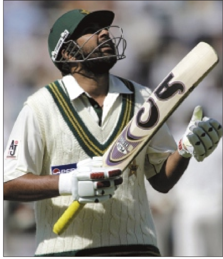
SHOULD'VE GOT A BIG ONE! Pakistan captain Inzamamul Haq is dejected after getting out on the fourth day of the first Test against India yesterday.

AFP, Kolkata The second cricket Test between arch-rivals India and Pakistan next week has failed to enthrall fans in this otherwise sports-crazy city due to the ongoing school and college exams and hot weather. Barely 5,000 of the 40,000 tickets up for sale for the general public were sold in the first two days at the 90,000-capacity Eden Gardens where the Test starts Wednesday, the Cricket Association of Bengal said. "It's not normal for Kolkata," said an official from the association, which is hosting the event. "Tickets are usually sold out in hours. Probably the examinations, hot weather and an overdose of international cricket has something to do with it," he said. The Test will be the third international cricket match in the city in four months after the one-day international against Pakistan on November 13 and the Test against South Africa two weeks later.