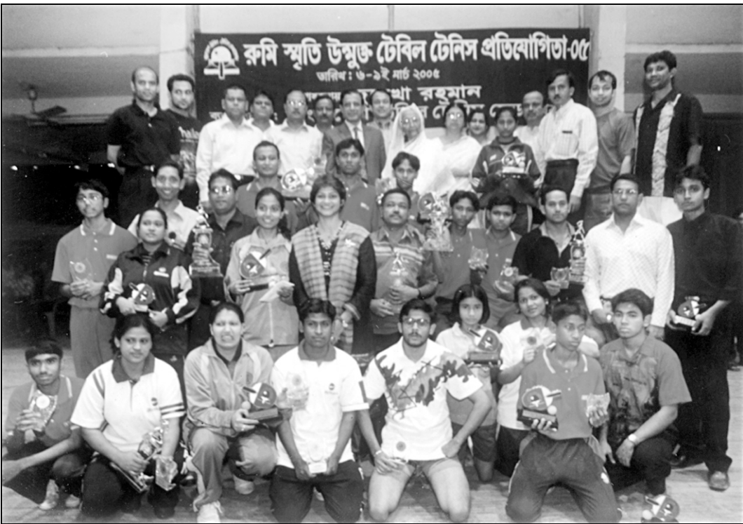
Winners of the Rumi Smriti Open Table Tennis Tournament pose for photographs with officials at the NSC Woodenfloor gymnasium yesterday.