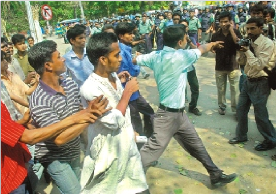
JCD and BCL activists deter photojournalists from taking pictures while they take away a Shibir member, in white dress, during yesterday's triangular clash at Jagannath University College.

As ruling BNP influential leaders, ward commissioners, transport leaders in connivance with the DCC's high-ups are actually behind the scene in the name of private SEE PAGE 11 COL 3