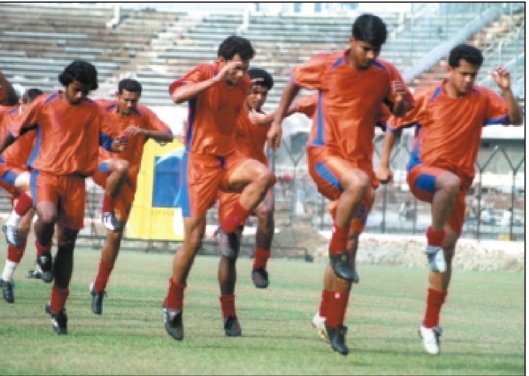
WELCOME TO BIG TIME: Players of Brothers Union warming up at the Bangabandhu National Stadium yesterday ahead of their AFC Cup first round fixture against Nisa FC of Turkmenistan.