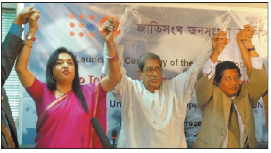
Participants join hands at the launching ceremony of a platform styled as 'Zero tolerance for the violence against women' at the National Press Club in the city yesterday. The UNFPA launched the platform to protest violence against women.