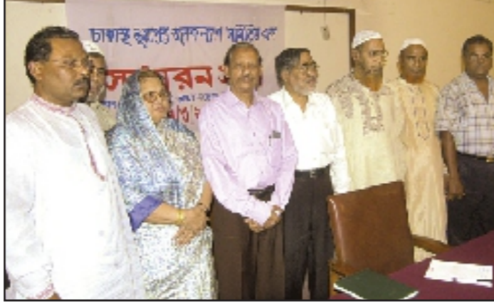
Leaders of Dhaka-based Bhuapur People's Welfare Association pose for photograph at its general meeting at the Bhaskar Novera Auditorium at the National Museum in the city yesterday.