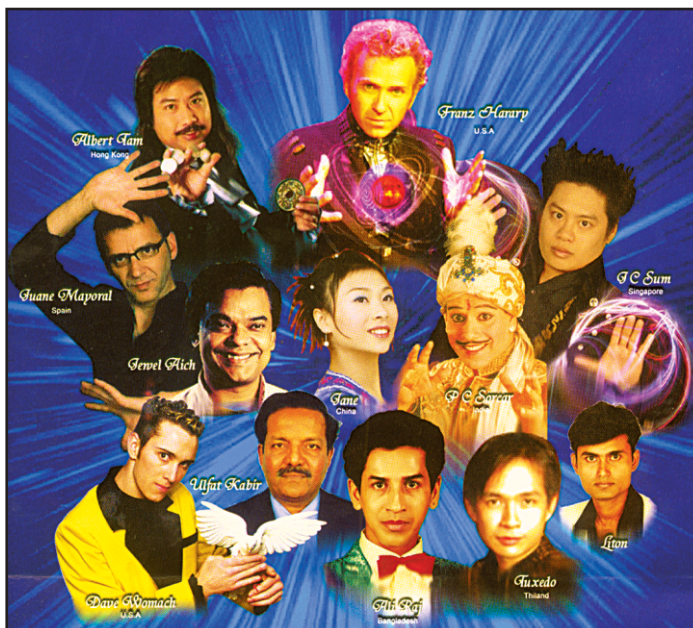
A world of magicians

So, now it is time for the Bangladeshi audience to witness astonishing tricks such as the 'vanishing' of a truck or a helicopter from the stage! The tickets will range from Tk. 300 to Tk. 1000.