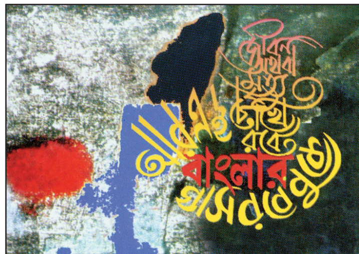
Mahbub Murshid's calligraphical work contains lines from poems of Jibanananda Das

Fourteen participants presented calligraphy in the exhibition, using different mediums--digital print, acrylic, collage and gauche. However, most of the calligraphy was done in digital print.