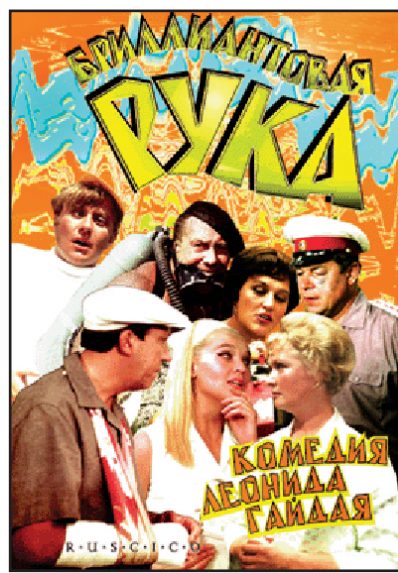
The Diamond Arm to be screened at the event