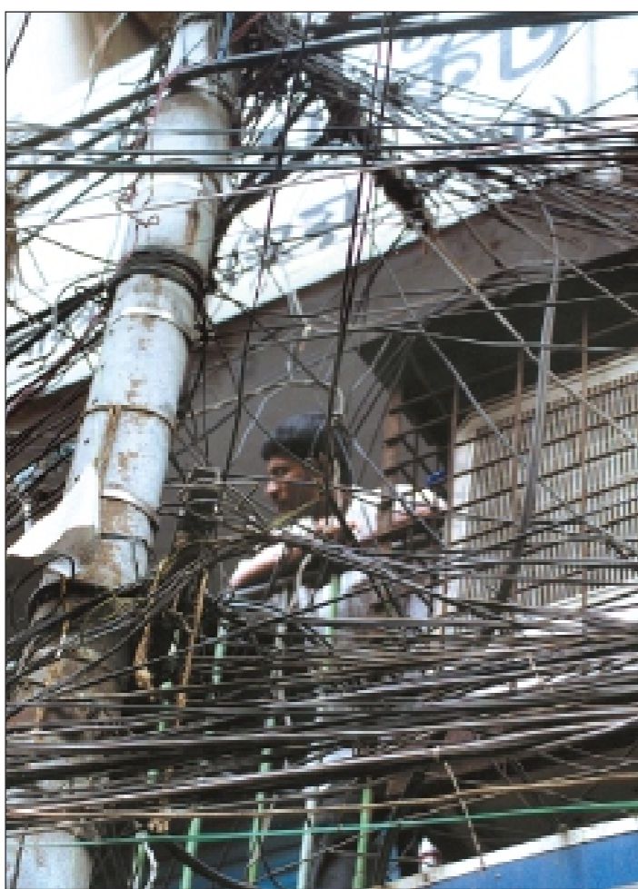
A dense tangle of electricity and telephone wires makes this electric pole on Nawabpur Road look like a hydra and as dangerous too, as the building behind, specially the air-conditioner, is too close for safety. But who cares?