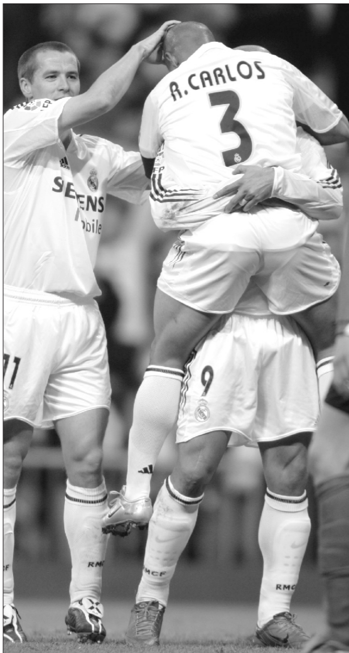
Real Madrid's Brazilian superstar Roberto Carlos (No 3) celebrates with compatriot Ronaldo as Michael Owen joins in after Carlos had scored against Betis at the Santiago Bernabeu stadium in Madrid on March 2.