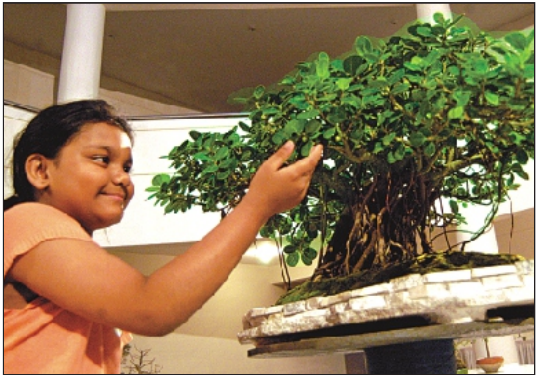
The Embassy of Japan and Bangladesh Bonsai Society have jointly organised a two-day Bonsai exhibition at the national music and dance centre of Shilpakala Academy.

They said Bangladesh should not be a moderate Muslim country as it was supposed to be a secular country.