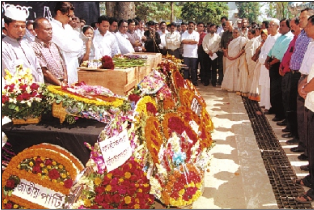
Different organisations pay their last respects to music legend and Language Movement veteran Abdul Latif at the Central Shaheed Minar in the city yesterday.