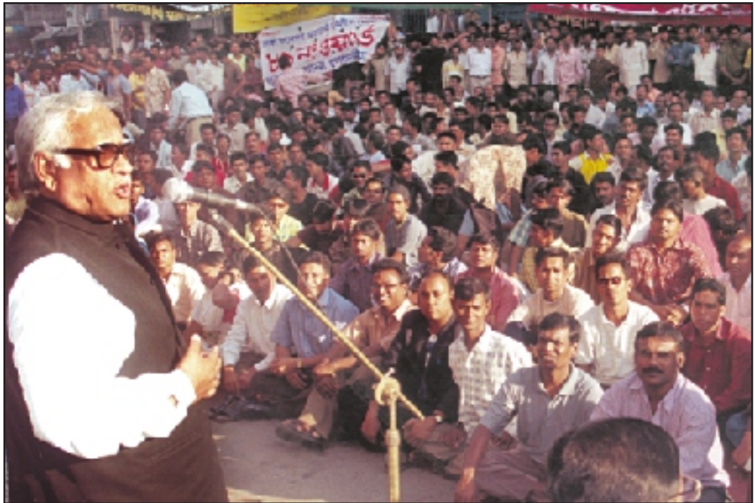
Awami League General Secretary Abdul Jalil speaks at a public meeting at Bangabandhu Avenue in the city yesterday. Bangladesh Awami Jubo League organised the meeting protesting police action on its procession on Saturday.