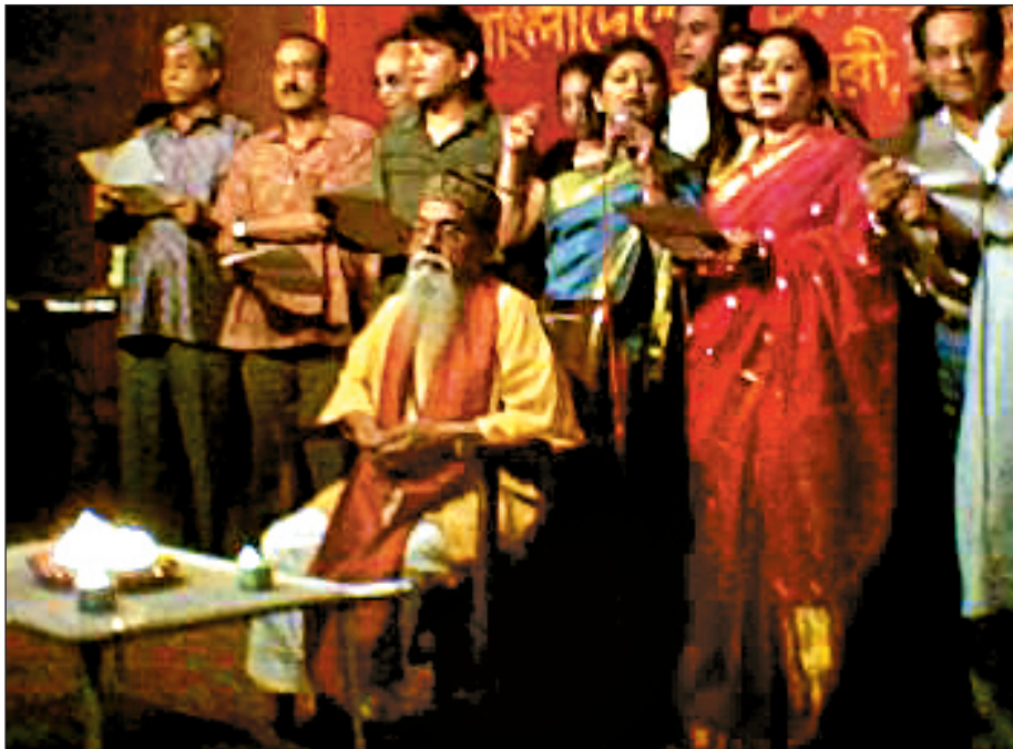
Eminent film directors and actors pay a choral tribute to Dutta (seated)

The celebration in honour of Subhash was overseen by popular film actress Kabori Sarowar. According to Kabori, "Subhashda has always had a special place in my heart. I was introduced to the film industry by him". The event started with a chorus rendition of Alo amar alo just as the world of Bangla movies was enlightened with the entry of Dutta. He was then greeted with flowers and gifts. Among