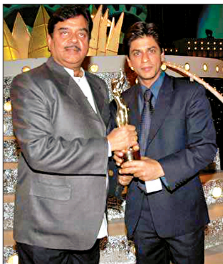
An elated Shah Rukh Khan (R) receiving award from Shatrughan Sinha