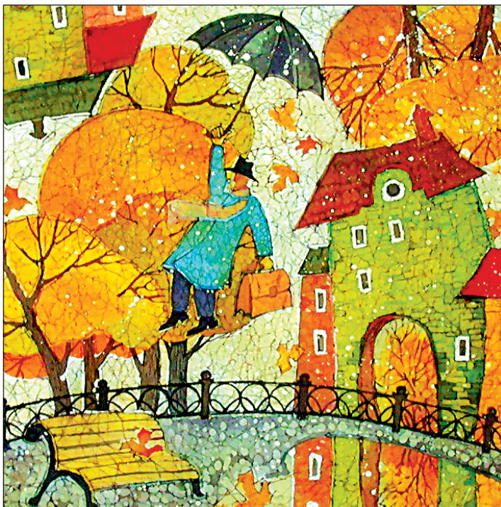
Liudmila's work displays neat forms and motifs

One of the batik works had a quaint old lady in blue, clutching on to a red umbrella and being blown by the wind. She was surrounded by gray, blue and brown trees with pink and golden leaves. Another image presented a beige mother cat suckling her snow white kittens. One of its eyes was opened while the other was shut; it was resting on a blue background. A presentation of Riga, the capital of Latvia, brought in pink, brown and purple houses and churches, with steeples, turrets and sloping roofs. They were lined with trees dotted with snow. Glowing roadside antique lamps in wrought iron added to the