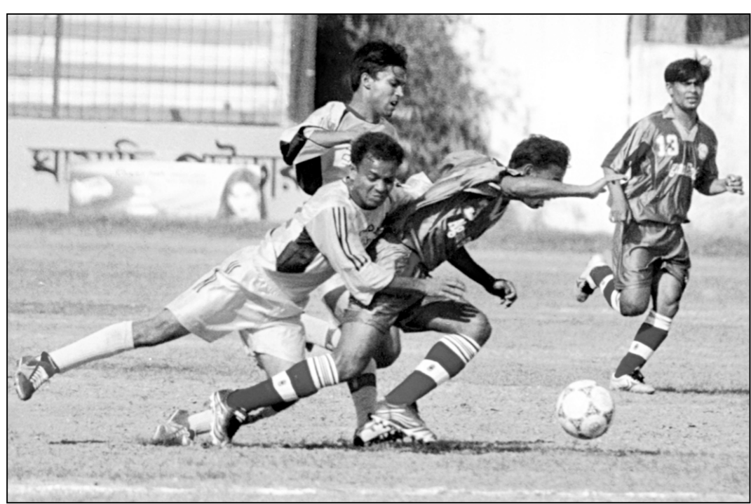
Action from the Federation Cup football clash between Agrani Bank and Dhanmondi at the Bishreshtha Shaheed Mostafa Kamal Stadium in Kamalapur yesterday.

AFP, Melbourne Victoria defeated Tasmania by 114 runs on Sunday to keep their Sheffield Shield cricket season alive ahead of this week's match with Queensland.