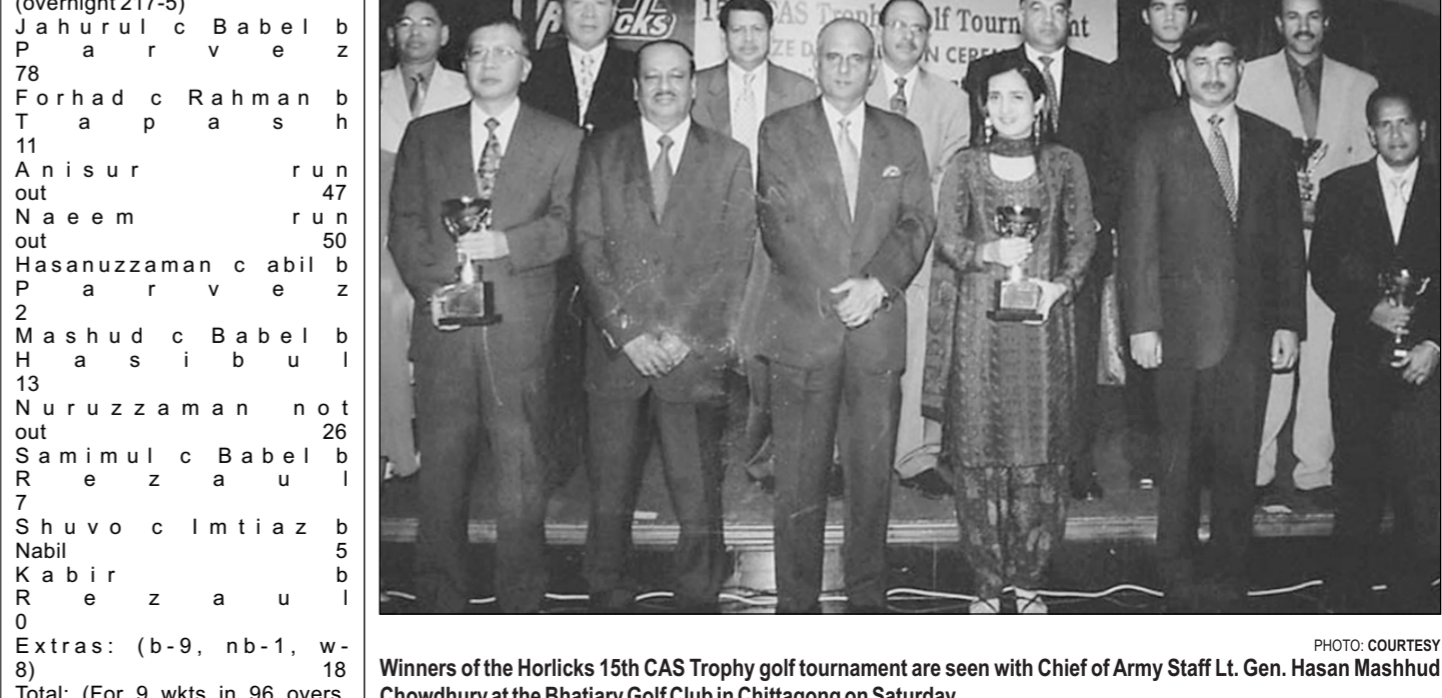
Winners of the Horlicks 15th CAS Trophy golf tournament are seen with Chief of Army Staff Lt. Gen. Hasan Mashhud Chowdhury at the Bhatiyari Golf Club in Chittagong on Saturday.