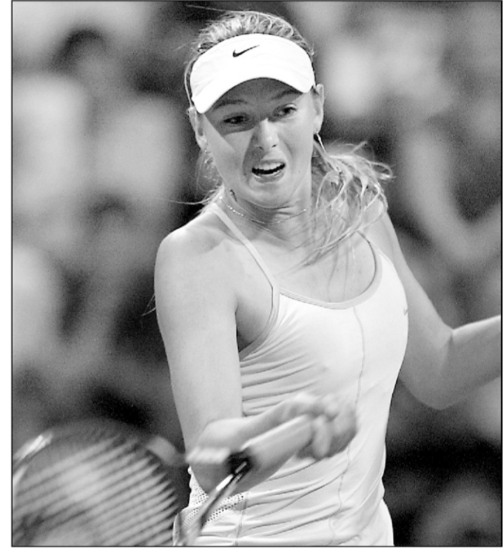
Russian Maria Sharapova plays forehand against Australian Alicia Molik at the Qatar Open final on Saturday.

Molik then retained her serve to close the gap at 3-4 but Sharapova held on to her serve and then finished off the match with an ace after saving a break point in the 10th game.