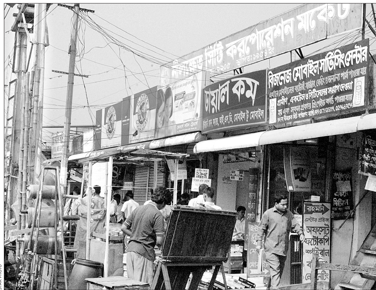
This DCC Market at Nilkhet is set to be replaced with a multi-storey one.