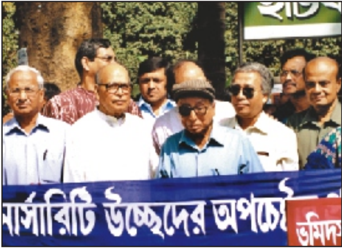
Leaders of Bangladesh Paribesh Andolon stage a demonstration in the city yesterday protesting the move to evict a horticulture and nursery located near the Asad Gate in Mohammadpur.

Weekly meeting of the Rotary Club of Dhaka North West will be held. Venue: Dhaka Club, Shahbagh. Time: 5.30pm.