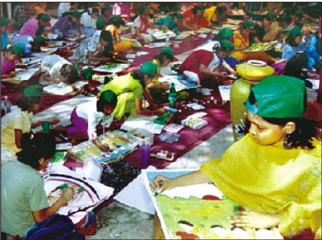
Children take part in an art competition on the Liberation War Museum premises in the city yesterday. The museum authorities organised the event to mark the death anniversary of Shaheed Sergeant Zahurul Haque.