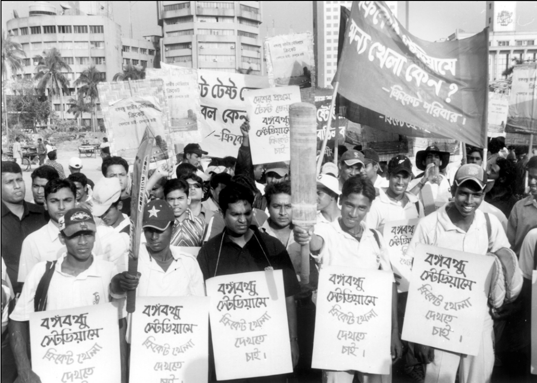
A group of cricket fans brought out a protest procession yesterday demanding international cricket matches in the future at the Bangabandhu National Stadium which has been handed over to the Bangladesh Football Federation.

ACROSS 23 Comes together 4 Mel of Coopers-town 7 It goes without saying 8 Binge 10 "The wonder-ful, won-derful cal" 11 Acces-sory for that little black dress 13 Prosper-ity, for many 16 Two, in Tijuana 17 Talk a blue streak? 18 Through 19 Toil 20 Suspend-ers alter-native 21 With 1-Down, patron of cripples DOWN 1 See 21-neighbor 2 Eastern 3 Dictionary 4 Starts busi-ness 5 Profes-sion-ist 6 Region (Abbr.) 7 Interoffice e-mail, maybe 8 Friction 9 Football team 10 Craze 11 See 21-neighbor 12 Across 13 Singer 14 Dictionary 15 Starts busi-ness 16 Profes-sion-ist 17 Region (Abbr.) 18 Interoffice e-mail, maybe 19 Friction 20 Football team 21 Craze Solution time: 21 mins. SELF LAY SLAP FALL USE LODI ECRU CHARADES CHARLIE HYENA RED WEE PRAYS CHARGES FAN MAIL CHARMED BODGE OIL SOD SALAD CHARLOT CHARISMA IDLE ADONE PIP FEES DYED AXE TIGAS