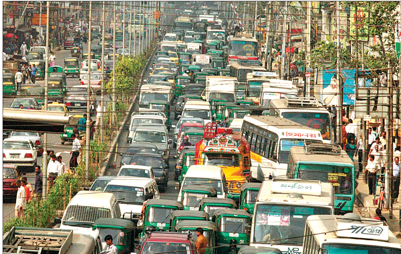
The planned intersection grade-separation double layer may put an end to a seemingly endless and motionless line of vehicles at busy intersections. This photo was taken at the Maghbazar crossing.