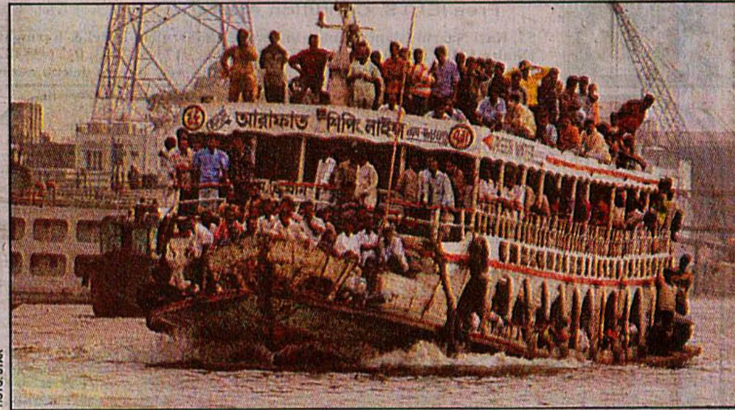
A visibly overloaded passenger launch approaches Sadarghat launch terminal yesterday undaunted by the MV Moharaj disaster that left at least 149 people drowned in Buriganga river Saturday night in the latest of a series of unchecked river accidents.