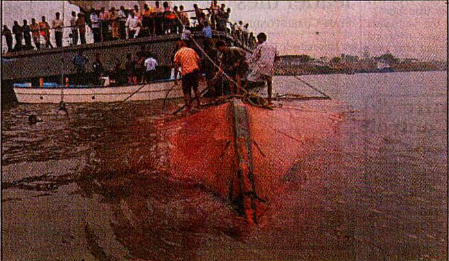
The crew of rescue vessel MV Rustam Sunday seen salvaging launch MV Maharaj, which sank with more than 200 passengers in the river Buriganga on Saturday night.

At least 120 people drowned and several others were missing as a passenger launch caught in a sudden storm capsized in the Buriganga river at Munshikhola in Pagla of Narayanganj on Saturday night. One hundred-eighteen bodies were recovered from the launch -- MV Maharaj -- which sank with more than 200 passengers and was salvaged yesterday. Around 60 passengers swam ashore or were rescued and others were still to be traced. Those killed in the worst launch disaster this year included 84 men, 25 women and nine children. Sixteen of them could not be identified.