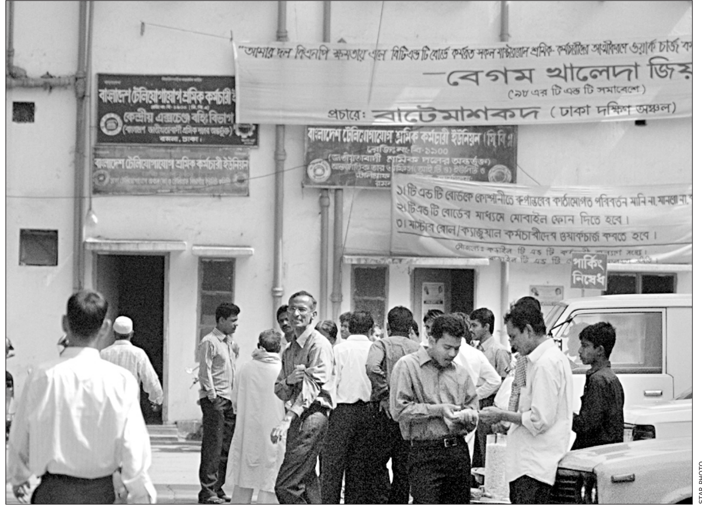
A mixture of staff and brokers gather around the Gulistan TNT office.

At present the T&T Board is proving service to around 4.5 lakh subscribers in Dhaka city through nearly a hundred camps under 19 telephone exchanges.