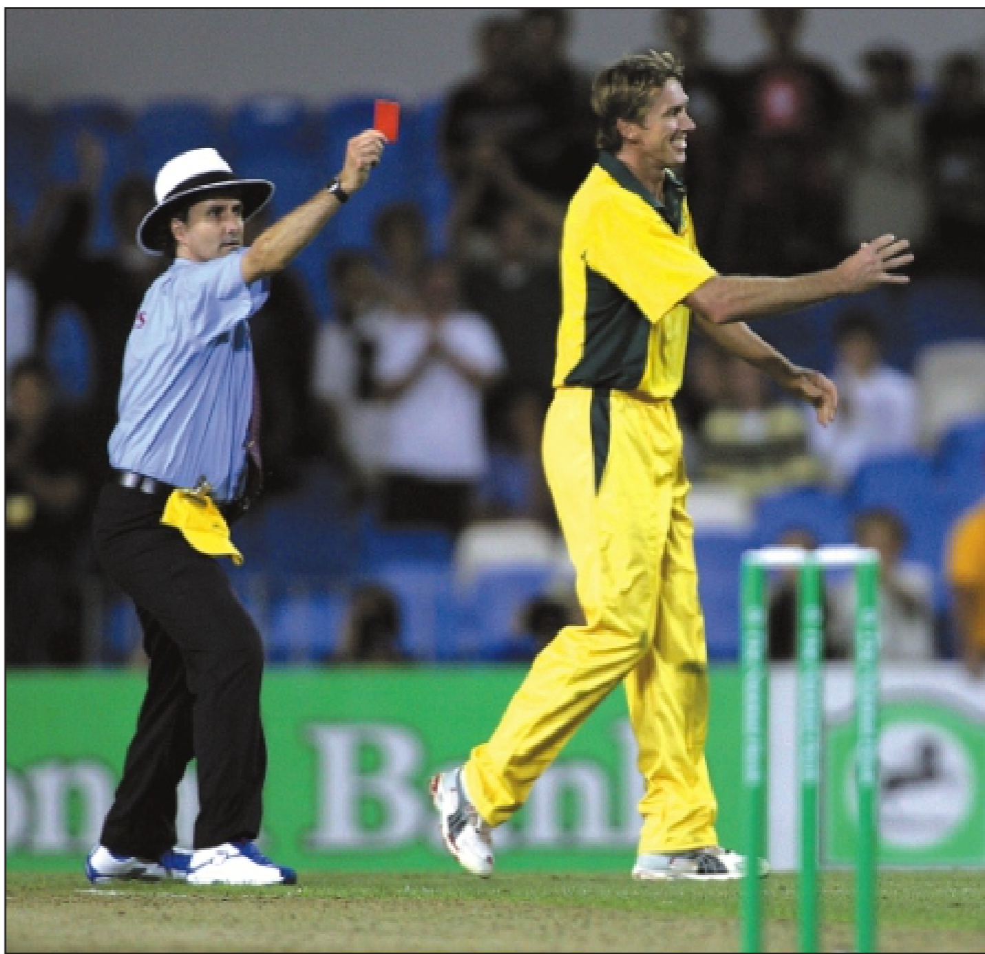
YOU NAUGHTY BOY! New Zealand umpire Billy Bowden (L) red cards Australian paceman Glenn McGrath for attempting to bowl underarm during the first Twenty20 match between the two Trans-Tasman rivals at Eden Park in Auckland yesterday.

DOULE-UP NAZIMUDDIN: Chittagong one-down batsman Nazimuddin guiding one past point on way to an unbeaten 204 on the second day four-day Ispahani Sixth National League match against Sylhet at the Chittagong Divisional Stadium yesterday.