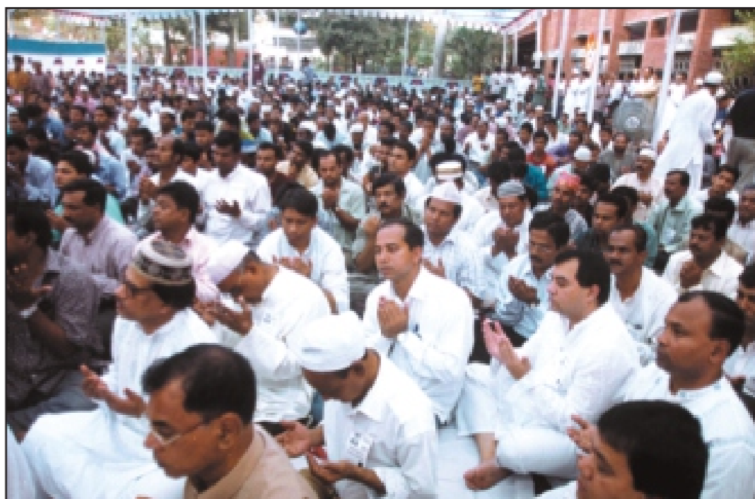
Followers, well-wishers and organisers pray during a milad mahfil for late Monem Munna at the Abahani Club premises yesterday. A football icon of the country, Munna died last Saturday due to multi-organ dysfunction. He was 39.

"If we could play in June or July in some countries -- in Zimbabwe, you can actually -- maybe we should be looking from that point of view."