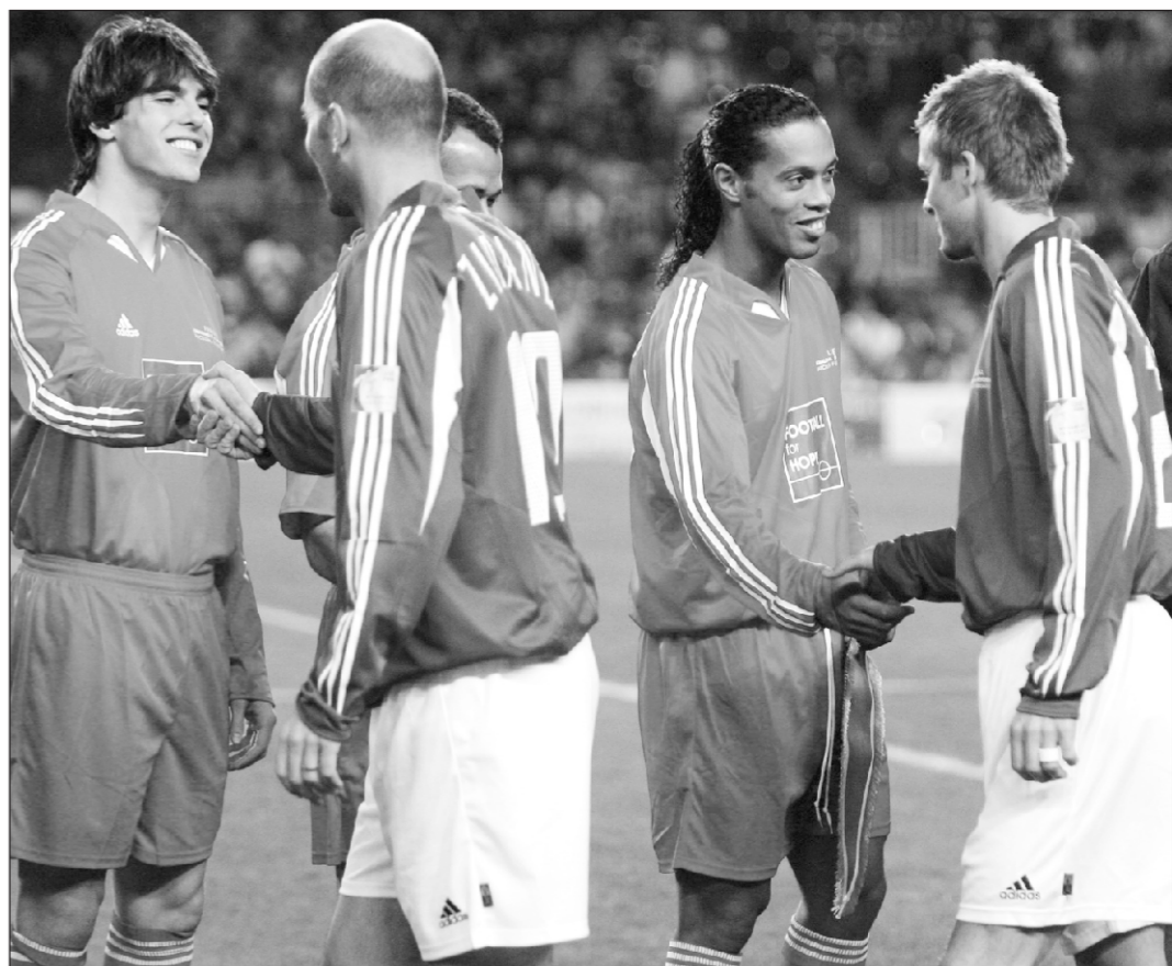
VERY NICE TO MEET YOU! Brazilian star Kaka shakes hands with French ace Zidane Zidane while world player of the year Ronaldinho exchanges pleasantries with English superstar David Beckham before the start of the tsunami benefit match 'Football for Hope' at the Nou Camp stadium in Barcelona on February 15.

In total football has raised an estimated ten million dollars for the December 26 disaster.