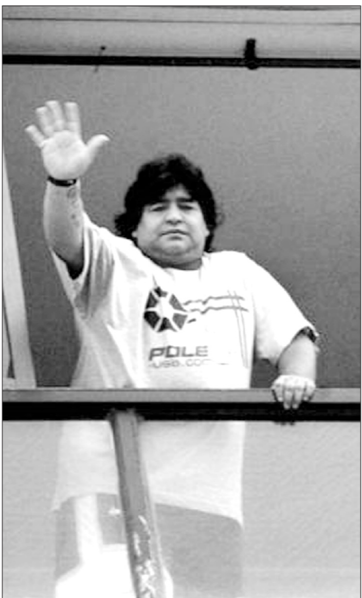
The legendary Diego Maradona waves to fans from the balcony of a hotel in Cartagena, Colombia on February 11.

At Christmas, Maradona defied his doctor's advice and returned to Argentina for one month. He went to Greece on a business trip last month.