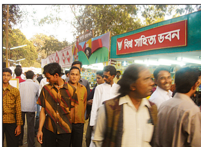
Enthusiastic visitors at the Book fair

Earlier, a major grouse of people who attended the Ekushey Book Fair was the heavy security at the event. A serpentine queue of people jammed the Ekushey Book Fair on Fridays and special holidays or the lazy hartal days due to heavy security. The queue is so long that it starts from TSC, often circles around Dhaka Medical College and the Doel Chattar and then comes to the entry gate of the fair. "This is not what Ekushey Book