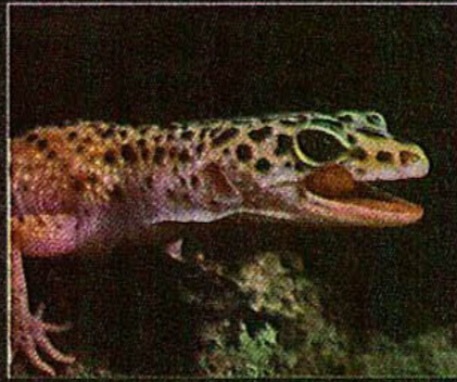
[ 21" regular playback ]

Asset Developments & Holdings Ltd Corporate Office: House 29 Road 39 Gulshan Dhaka Tel: 8857230, 8857231, 8857232, 8857233, 8857234, 8857495, 8857496, 8857497, 8857498 8857499, 9882245, 8829437 Mobile: 0173-018405, 0173-018406, 0173-018407, 0173-018408 0173-018409, 0173-02448, 0171-438430, 0171-435994, 0174-016886, 0171-613360 0171-439762, 0171-426854, 0171-439768, 0171-438431, 0171-438432, 0171-435021 0174-016717, 0174-016887, 0171-627238, 0171-694343, 0174-016716, 0171-603578 0174-039842, 0174-039843, 0174-039844, 0174-039845, 0174-039846, 0174-039847 0171-426855, 0174-048448, 0174-040457, 0174-040458 Fax: 880 2 8828272 E-mail: asset@agm.com