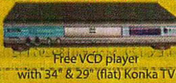
Free VCD player with 34" & 29" (flat) Konka TV