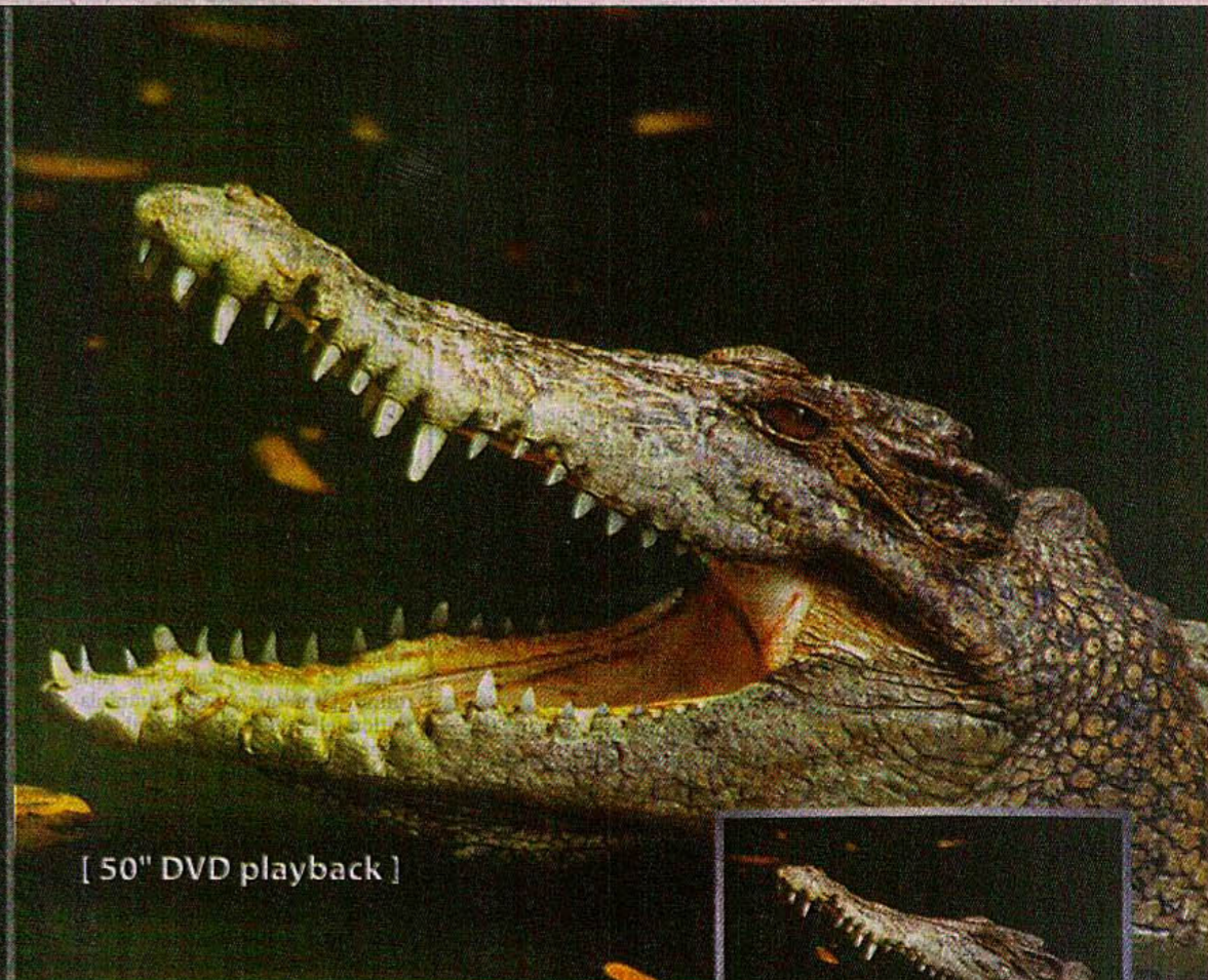
[ 50" DVD playback ]