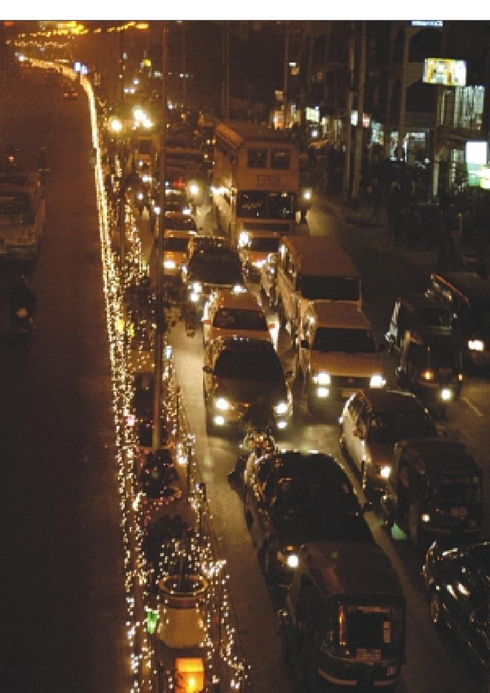
The 13th Saarc Summit was postponed six days ago, but the illuminations on the road dividers in the capital are still on, wasting huge electricity in the peak hours. The picture was taken yesterday from near Farm Gate.

When asked, BAF authorities refused to give any information about the accident and suggested consulting the ISPR.