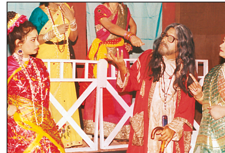
A scene from the play

Mujibur Rahman Dilu has adapted German drama legend Bertolt Brecht's The Threepenny Opera to the Bangladeshi context. The play satirises the contemporary social structure of Bangladesh, where the bourgeois, criminals and policemen are in collusion and perpetrate evil.