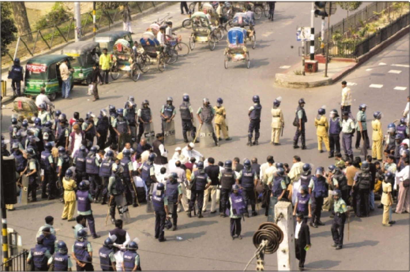
The main opposition Awami League lawmakers hold a meeting under police guard at Russel Square in the city during the hartal hours yesterday.

His gulkhwani will be held at his residence at 6/8 Block-E, Lalmatia in the city after Asr prayers on February 11.