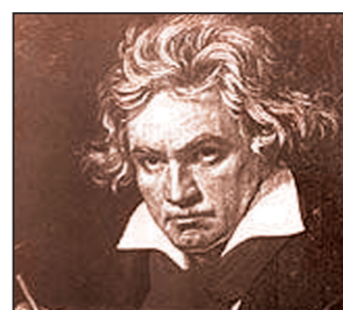
Edgar Allan Poe

No one, not even Jerome, knows the identity of the so-called "Poe Toaster." The visit was first