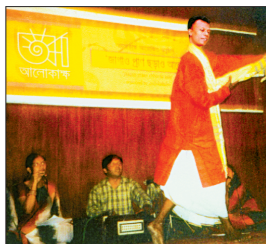
A stage performance by Mahua Shilpighoshti

It's back to the roots. Several groups of youth in the country have launched a concerted effort to popularise the important chapters of Mymensingh Geetika (indigenous compilation of the great bards). Among the facets of Mymensingh Geetika that they have staged are Mahua Sundari, Malua Sundari, Dewana Madina, Chandrabati, Kajol Rekha, Velua Sundari, Sonai Madhab and Kamala Ranir Sagar Dighi. These literary works have been promoted by Mahua Shilpighoshti, a cultural organisation, for the last few years.