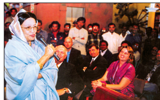
Khurshid Jahan Haque, Minister for Women and Children Affairs, with guests at the FDC set for Sisimpur

The series for children is co-produced by the non-profit educational organisation Sesame Workshop, says a press release. Sisimpur is a Bangladeshi adaptation of the world famous television series Sesame Street and features Bangla-speaking Muppets, animation and live-action segments. The series is funded under a grant of United States Agency for International Development (USAID) and is expected to debut on BTV later this year. Sesame Workshop has co-produced similar programmes in over 20 countries in the world over the last 35 years.