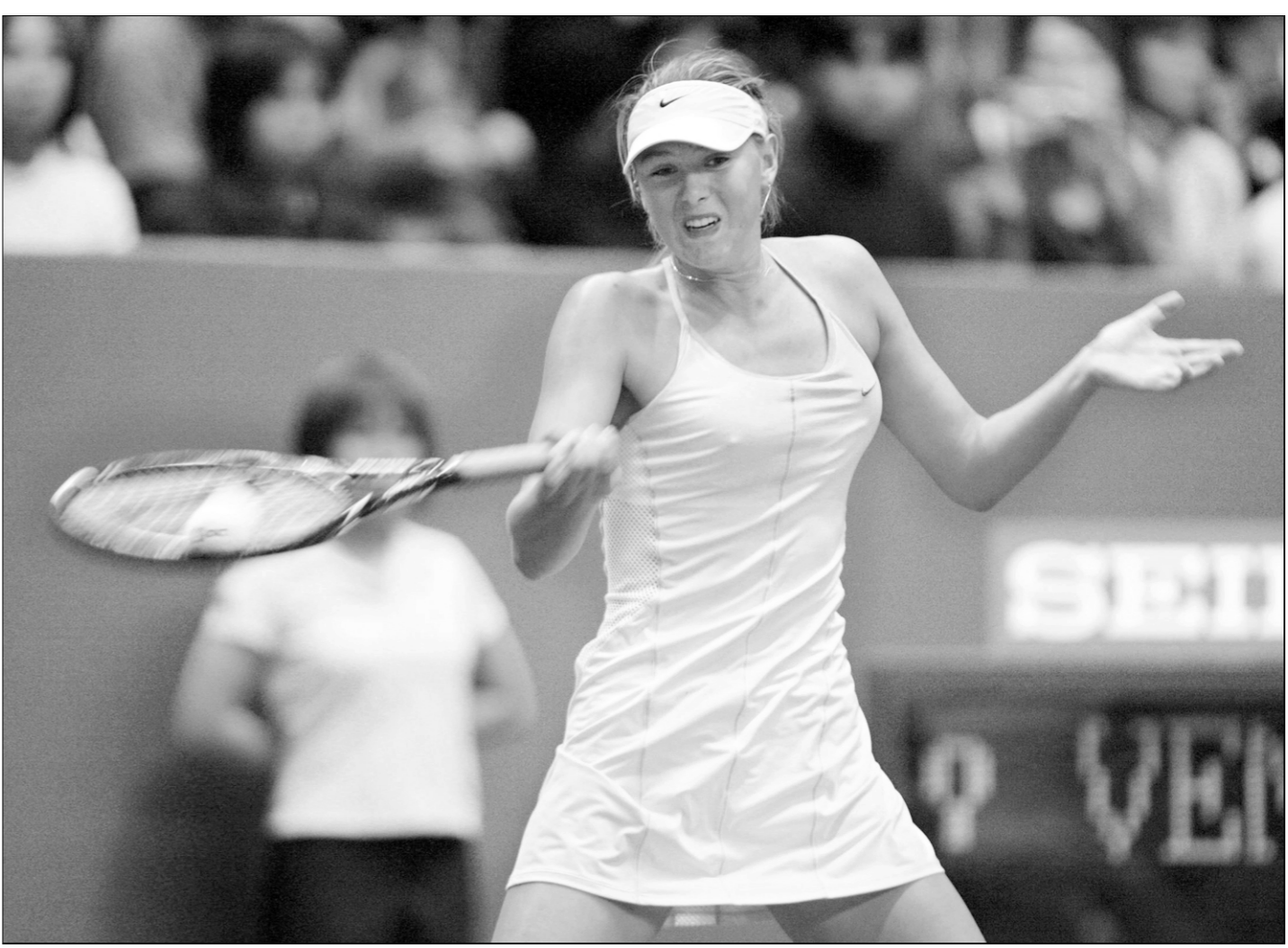
Russian ace Maria Sharapova executes a return against Maria Vento-Kabchi of Venezuela during their Pan Pacific Open match in Tokyo on February 2.