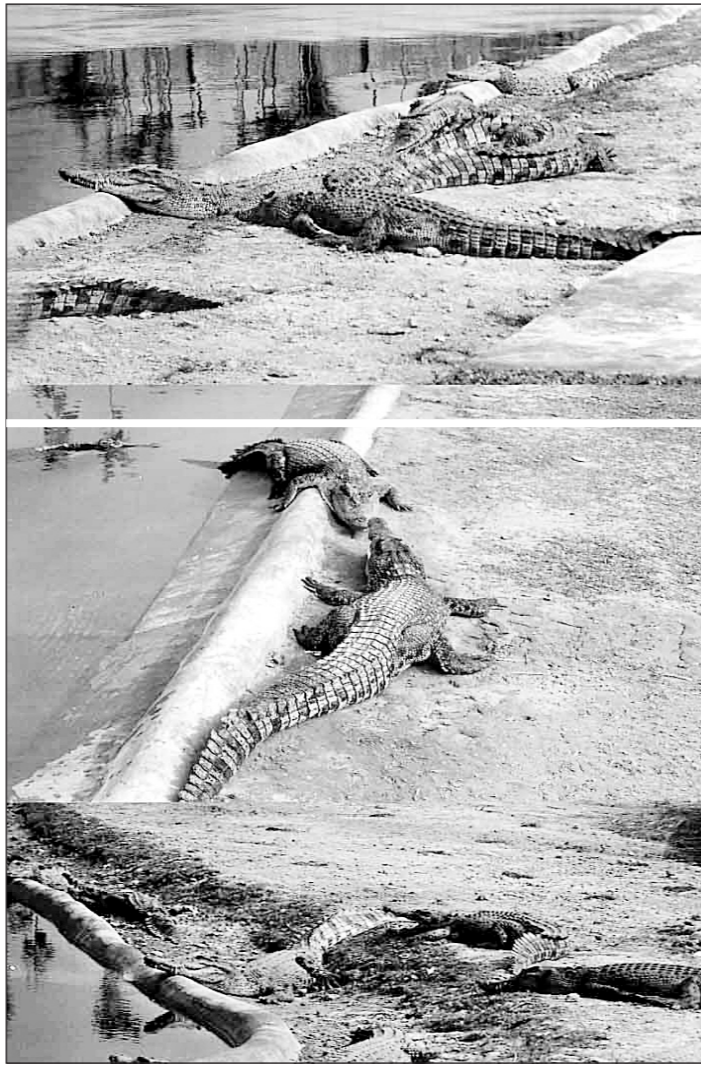
Crocodiles being reared by Reptiles Farm Ltd at its project ponds in Bhaluka.