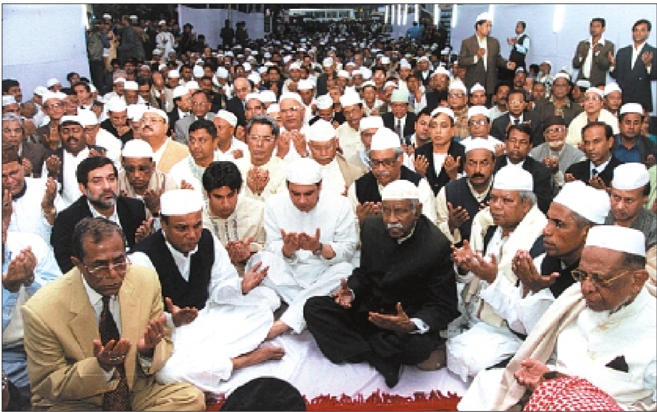
Admirers and political leaders offer munajat at the qulkhwani of former finance minister Shah AMS Kibria at the Dhanmondi residence of the Awami League leader yesterday.