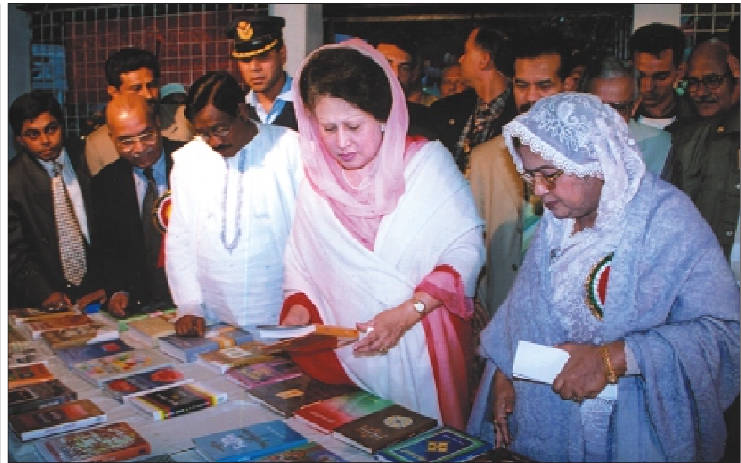
Prime Minister Khaleda Zia looks at books at a stall after opening the Amar Ekushey Book Fair on the Bangla Academy premises yesterday.

But a PDB high official unwilling to be named defends the Meghnaghat-2 bidding process: "There is nothing wrong in Belhassa's proposal. They comply with our standard."