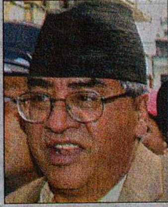
Prime Minister Sher Bahadur Deuba