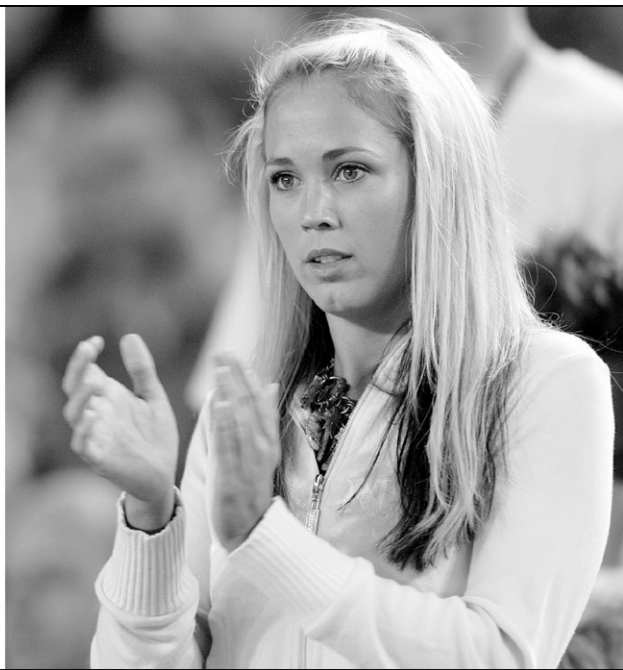
Lleyton Hewitt and Bec Cartwright