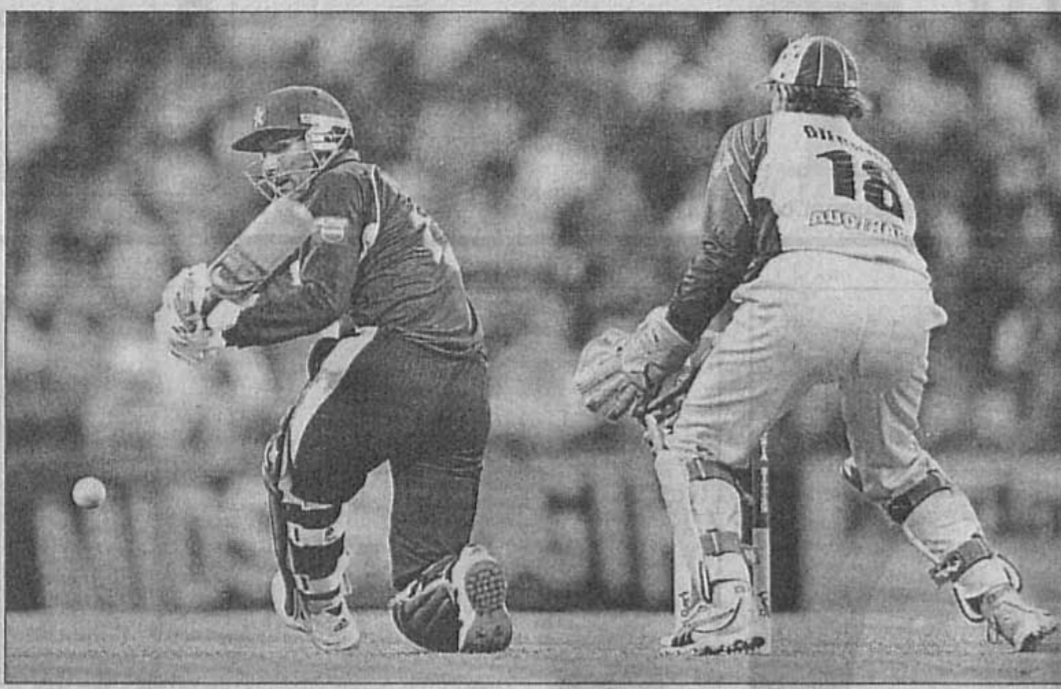
MAN-OF-THE-MATCH: Pakistan's Abdul Razzaq sweeps one on way to scoring a match-winning 63 against Australia in the VB Series in Perth yesterday.

"I'm a batsman and a wicketkeeper. But I am more a captain. And as a batsman my job is to score runs and I go out enjoying that."