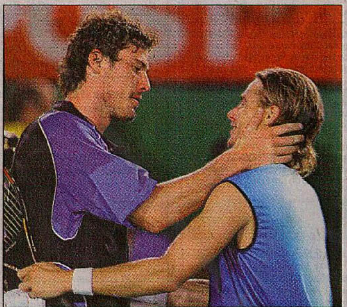
SOMEONE HAD TO LOSE: New Australian Open men's singles champion Marat Safin (L) explains something to Australia's Lleyton Hewitt yesterday.