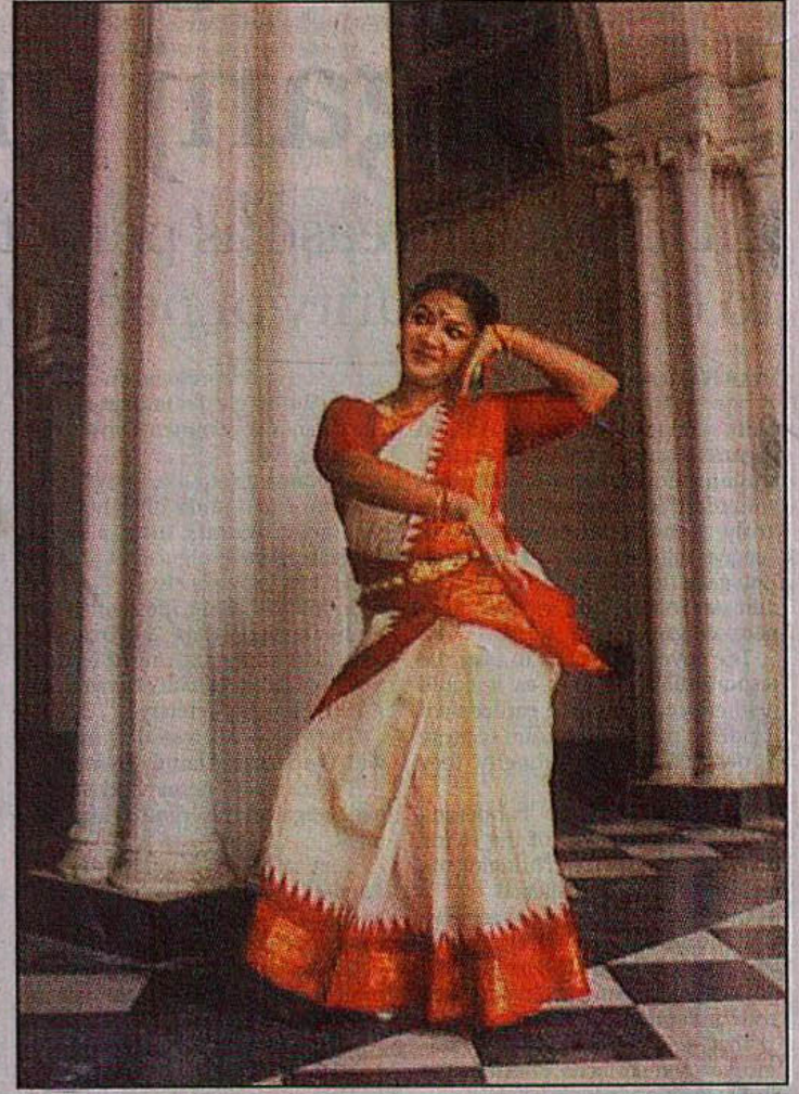
Unravelling the wonders of Odissi dance