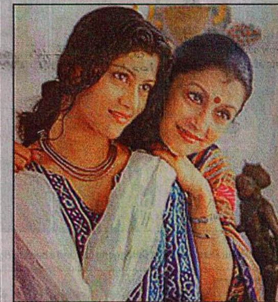
The mother-and-daughter duo

One of India's best known filmmakers, Aparna Sen, is all set to start her new film. The director of Paroma and Paromita Ek Din is making an English-language film. Entitled 15 Park Avenue, the film will feature her Mr & Mrs Iyer stars Rahul Bose and daughter Konkona.