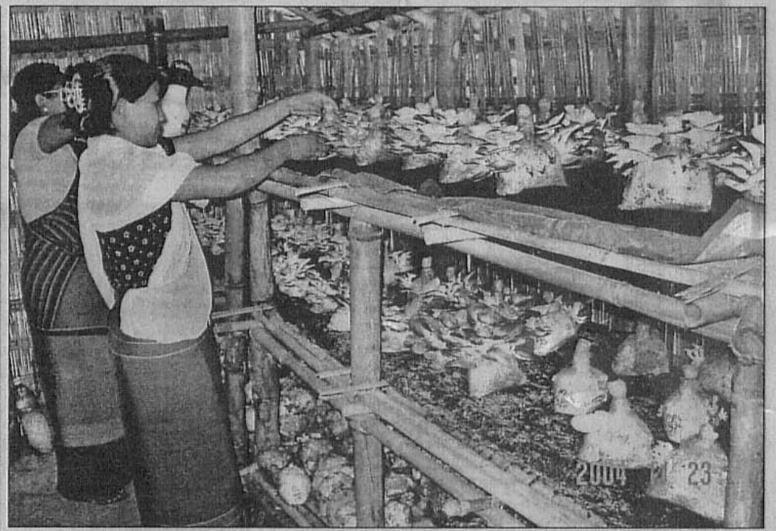
Mushroom produced are being store at a house in Rangamagi, awaiting marketing.

Such incidents are taking place as the perpetrators could not be brought to book, she said and urged the government to take all out steps to nab them.