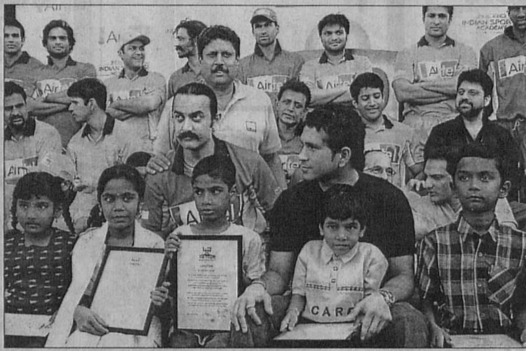
Indian cricket superstar Sachin Tendulkar (2nd from R), Bollywood star Aamir Khan (3rd from L, middle row) and former Indian cricket captain Kapil Dev (behind Khan), with other cricketers, are seen with tsunami affected children from Tamil Nadu town of Nagapattinam prior to the start of the Airtel Cup, a fundraising game, at the Wankhede Stadium in Mumbai on Saturday.

"I was going to give myself the best possible chance, knowing that I was going to have a rest straight afterwards."