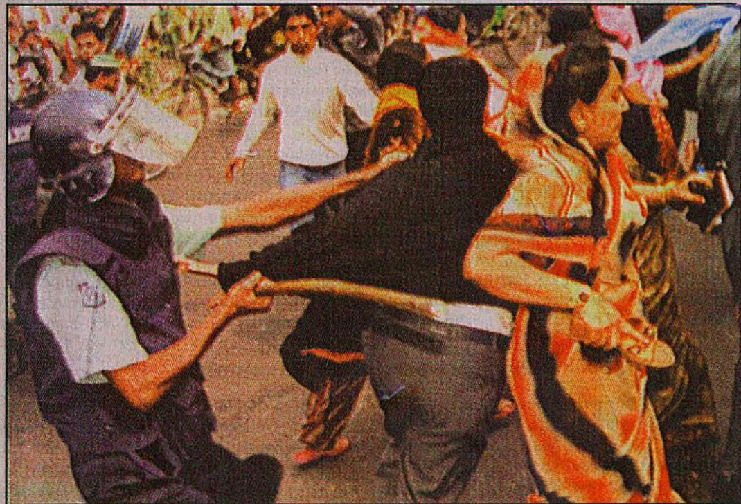
A policeman beats up a female Awami League worker at Paltan in the capital during yesterday's hartal called to protest the killing of former finance minister Kibria and four others in a grenade attack in Habiganj.