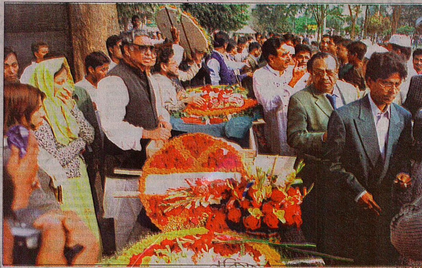
People from all walks of life pay their last respect to former finance minister and opposition Awami League Advisory Committee member Shah AMS Kibria at Central Shaheed Minar in the city yesterday.