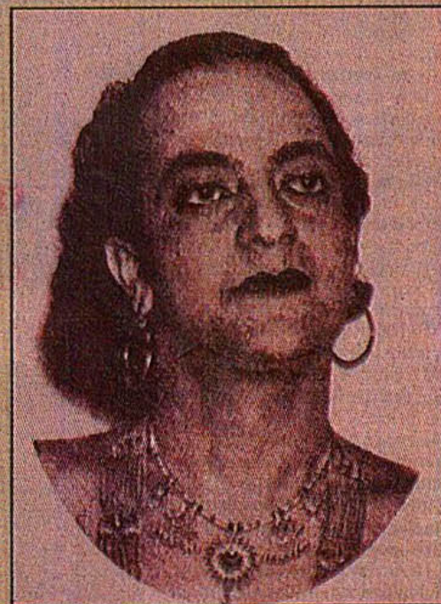
Belgium and France.

In January 1940, Bulbul came to Dhaka with his troupe and performed a number of dance dramas. During the Second World War, he moved to Chittagong and worked at different places from 1943 to 1947. In 1953 he visited Europe with his troupe, performing in Britain, Ireland, Holland,