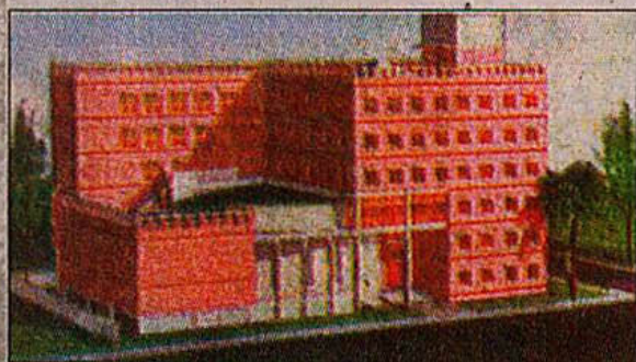
The model of the proposed Chhayanaat Bhaban

Rajdhani Unnayan Karttripakkho (Rajuk) has recently approved the revised design of the proposed Chhayanaat Bhaban.