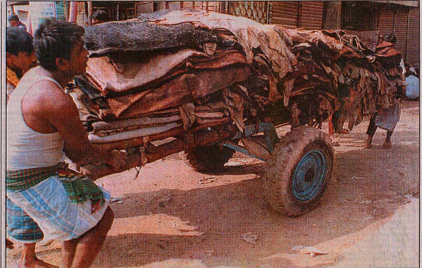
A handcart full of raw cattle hide after reaching the capital by river is on way to the tanneries in Hazaribagh. Hides are particularly abundant and less pricey now after the annual sacrifice of the Eid-ul-Azha.