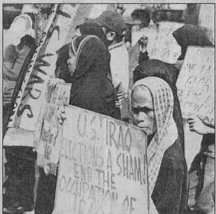
Filipino leftist group and Muslims display anti-US banners and a mock missile during their protest near the US embassy in Manila yesterday. The protesters are condemning the US-led attack on Iraq and the holding of election in that country later this month.

Across the Tigris river in the mostly Sunni Adhamiya district, however, the mood is more pessimistic.