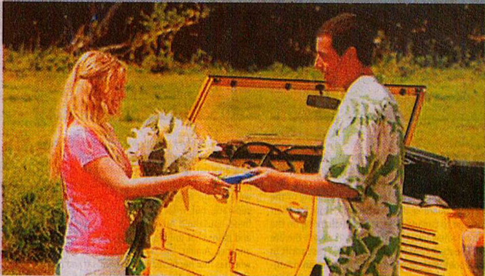
figure out a way to make their life work.

After starting his courtship of Lucy each day from scratch -- the variations are sweet, extremely funny, stupid, and occasionally all three -- he creates an explanatory video with which she can start her morning, get over the necessary trauma, and move on with her life. It's not very believable but very sweet and that is the movie's strong point. There's a real charm to the notion that a couple might share a first kiss every day.