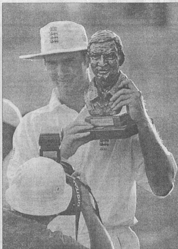
A proud England captain Michael Vaughan shows off the Test series trophy after the fifth and final Test against South Africa at the Super Sports Park in Centurion on January 25.

SOUTH AFRICA: First innings 247 (De Villiers 92, Rudolph 33, Smith 25, Boucher 25; Flintoff 4-44, S Jones 4-