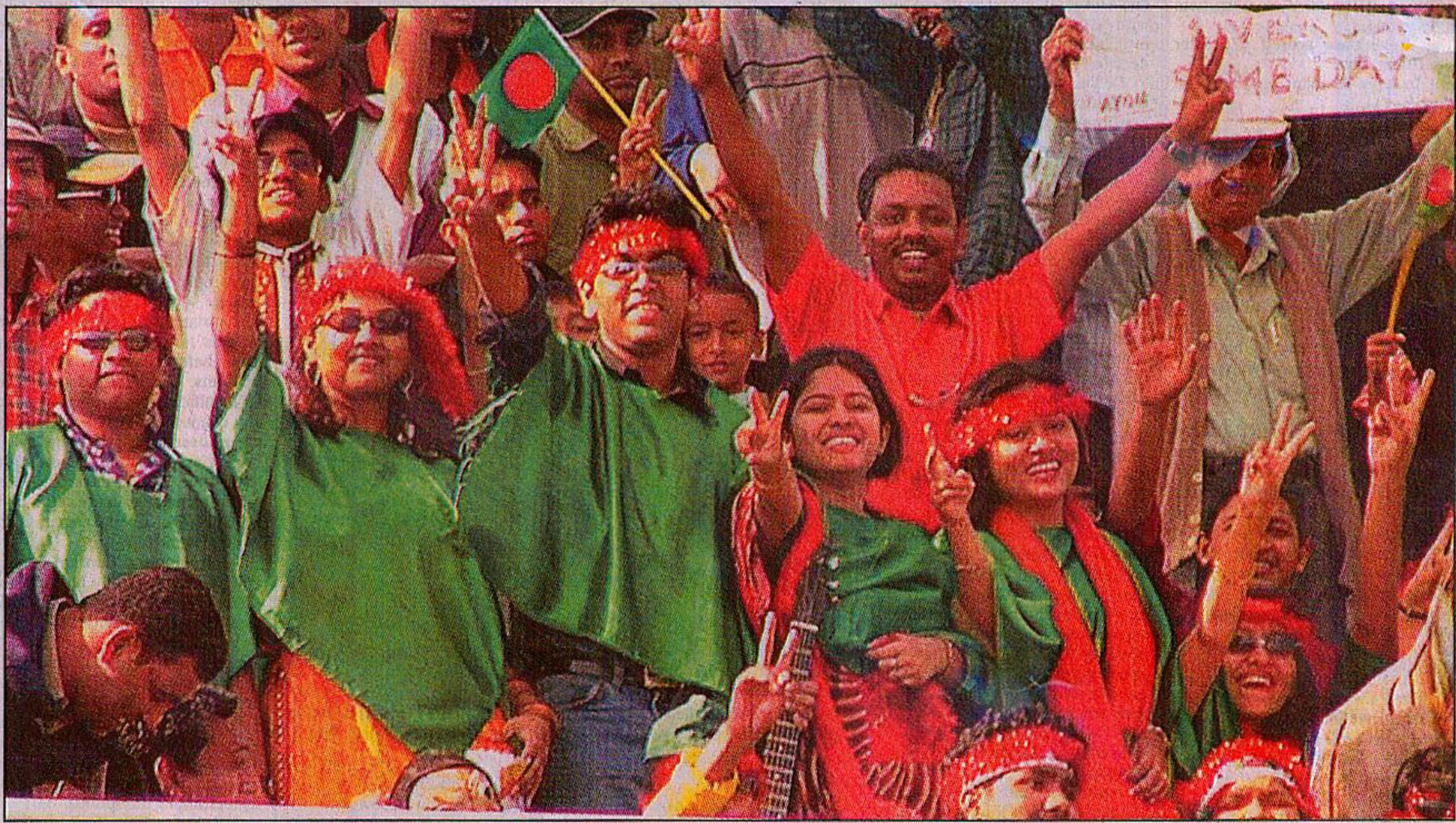
TIGERS' INSPIRATION: Young fans clad in Bangladesh colours liven up the stands at the MA Aziz Stadium during the third one-day international yesterday.

"We didn't play good. But I think we also couldn't keep up the pace during batting. There were no good partnerships building and wickets fell at regular intervals."