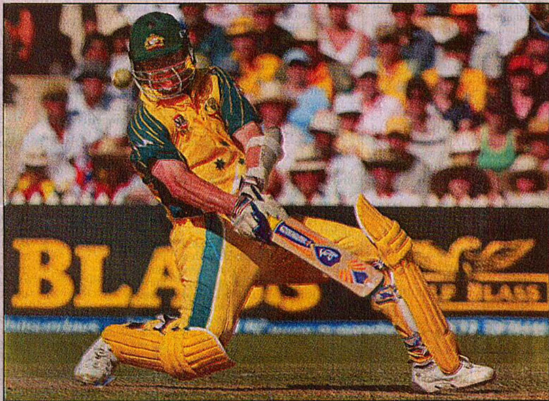
BRILLIANT BRETT! Australian firebrand Brett Lee slices one towards the point boundary during his quickfire 38 against the West Indies at the Adelaide Oval yesterday.