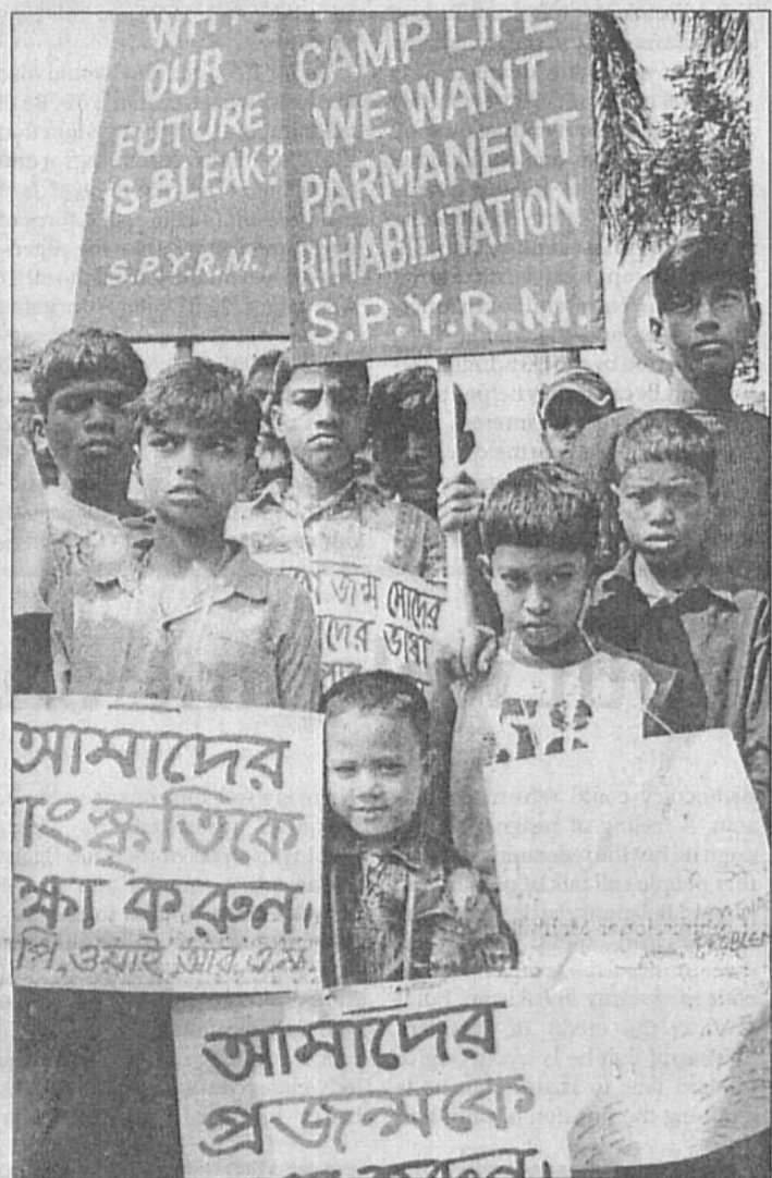
Children of stranded Pakistanis stage a demonstration in front of the High Court yesterday demanding their permanent rehabilitation.

Annual examinations of Dhaka University which was scheduled to be held at Curzon Hall examination centre today have been postponed due to unavoidable reasons. Fresh date will be announced later, said a press release.