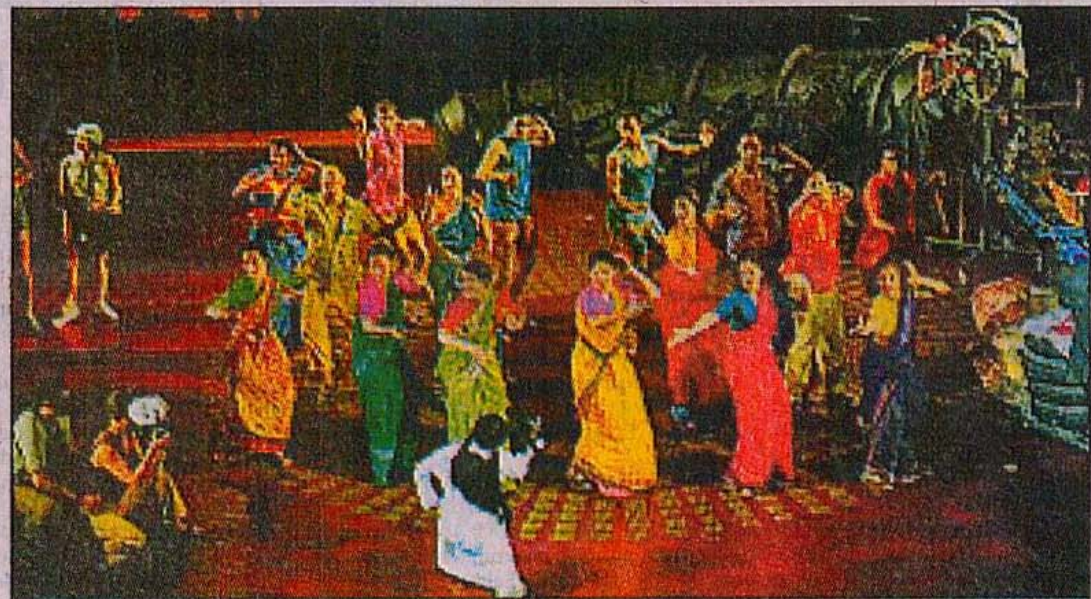
A scene from the grand musical show