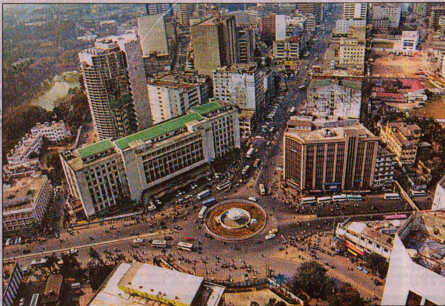
Motijheel, the busiest commercial area looks deserted yesterday as the Eid holiday hangover still persists.